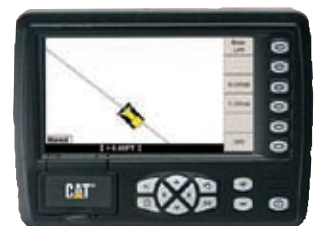
AccuGrade GPS Display